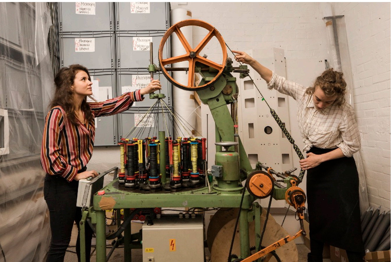
Research for the Digital Jacquard