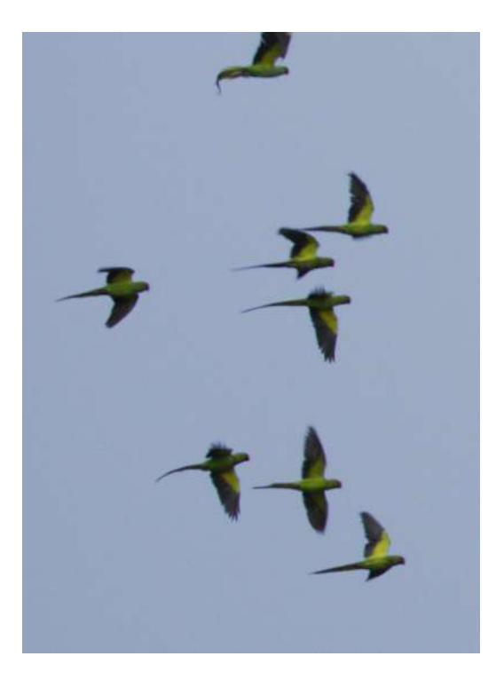
CG03. Document photographique, Cyprien Gaillard, KOE // , 2022. Video. Produced by VOLTE, funded by Medienboard Berlin-Brandenburg and Bundesregierung für Kultur und Medien.