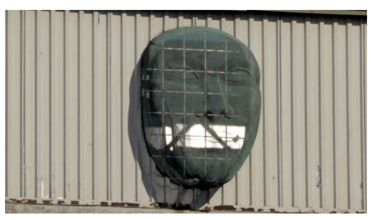
CG10. Cyprien Gaillard, Ocean II Ocean , video, 2019. Courtesy of the artist, Sprüth Magers and Gladstone Gallery © Cyprien Gaillard