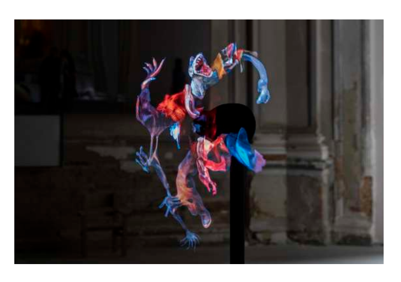
CG05. Cyprien Gaillard, L'Ange du foyer (Vierte Fassung) , holographic LED display, stainless steel base, 156 x 75 x 24 cm, 2019. Courtesy of the artist, Sprüth Magers and Gladstone Gallery © Cyprien Gaillard