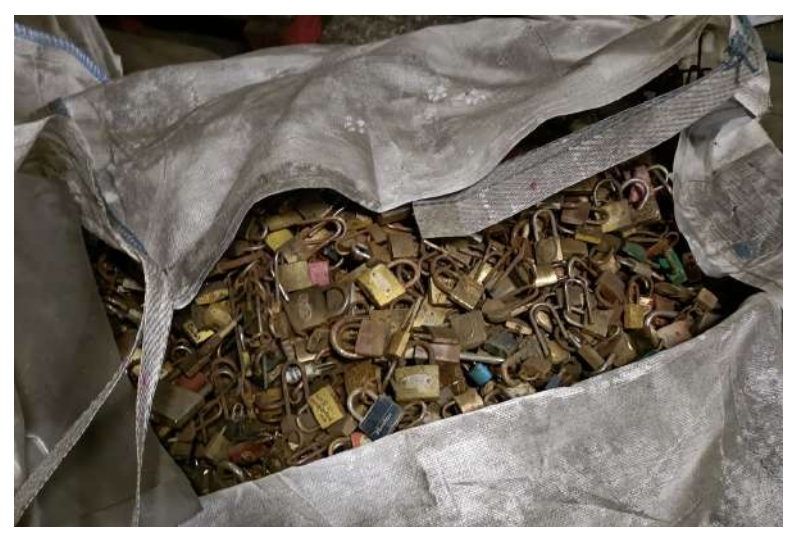
CG04. Photographic Documentation. Reference for HUMPTY \ DUMPTY . © Cyprien Gaillard. Photo Credit: Max Paul, 2021